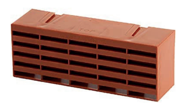
Air brick (terracotta)